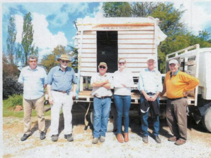
Watch Box Successfully on truck for transport to Orange Regional Museum