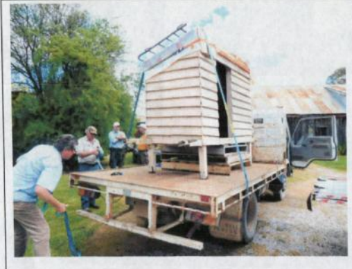
① How do we get that onto the truck? ② Many hands make light work!! ③ Won't fit in covered truck – lucky we have an alternative!! ④ That's better!!